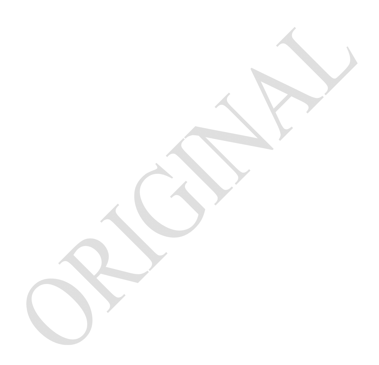
NOTE: Students enrolled in physical education K-5 shall be reported through periodic student membership surveys.

STATUTORY AUTHORITY: 1001.42 (16)(a), (17)(a), and 1003.455(1), (2), F.S.